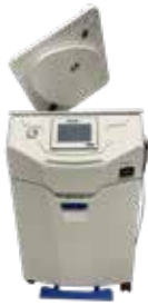
Soluscope Serie 5