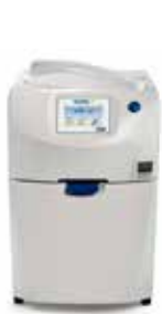
Soluscope Serie 4 PA

Disinfectant for flexible endoscopes to be used exclusively with Soluscope Serie 4 PA, Serie XS and Serie 5