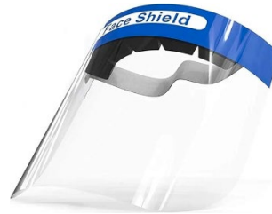
Ref. product 651200