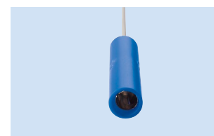
A = 4 mm connector