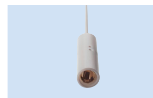
F = 3 mm connector