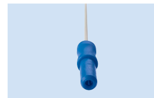
J = 2 mm connector