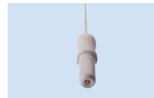
K = 1.5 mm connector