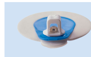
F = 3 mm connector