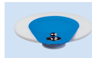
S = Stud