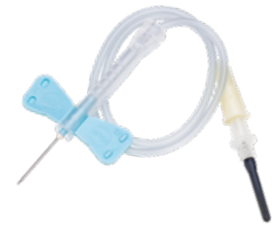
Sol-Care™ Safety Blood Collection Needle with Pre-attached Holder