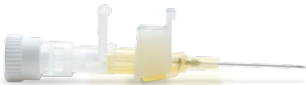
BD Neoflon™ Pro IV Catheter 24 gauge