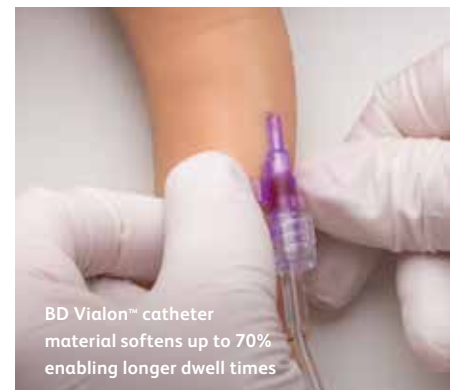
BD Vialon™ catheter material softens up to 70% enabling longer dwell times