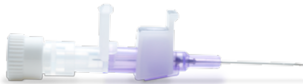
BD Neoflon™ Pro IV Catheter 26 gauge