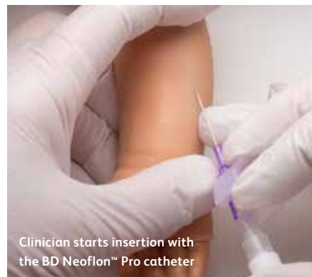
Clinician starts insertion with the BD Neoflon™ Pro catheter

BD Instaflash™ needle technology incorporates a notched needle, which is designed to improve insertion success. By having quick blood visualization, clinicians can immediately confirm vessel entry. This may help improve insertion success, and therefore reduce the number of attempts.