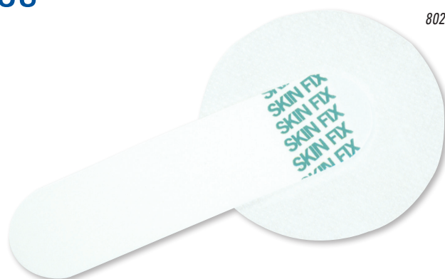
Skin Fix™ (Box of 25)