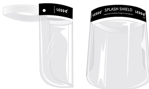
Illustration: See to the right

Product: Splash Shield Trade Name: LESS Splash Shield - engangsvisir Product Code: 8200 90 Intended purpose: Single use face protection against splashes of dangerous substances such as chemicals, particles, possible contagious droplets etc.