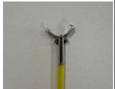
Rat tooth forceps