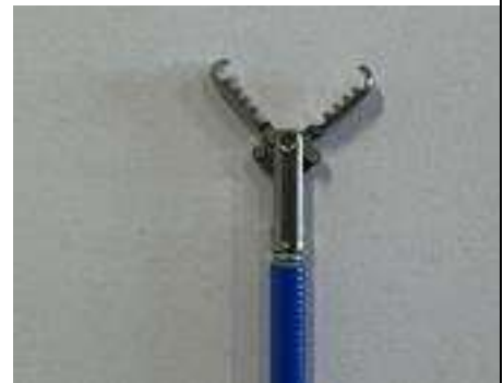
Mixed tooth forceps